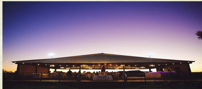
Our generous function area and deck

Attached are our available packages. We look forward to meeting you and assisting you make your event as memorable and relaxed as possible. Once your date is set your booking can be secured with a $500 deposit.